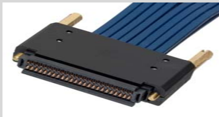
Samtec's Spirit™ Connectorless Technology Patent Pending