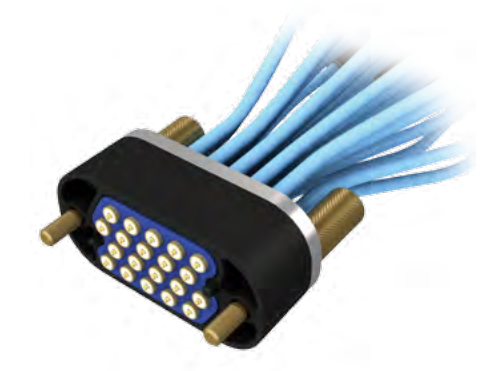
BQRA 23 AWG Quad Row Cable Assembly 20 Positions End 2 Options: 2.92 Jack/Plug