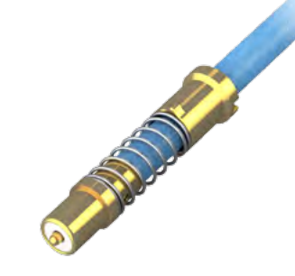
RF23S 23 AWG 50 Ω Single Microwave Cable Adaptor Additional End Options: 2.92, *2.40, *1.85 Jacks/Plugs *In Development