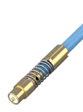
BE25S 25 AWG 50 Ω Phase Matched Microwave Cable Adaptor Pairs Additional End Options: SMA, SMP