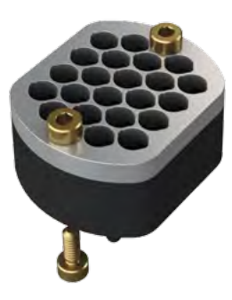
BAR Test Point Array 22 Positions