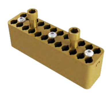
BDR Double Row Test Point Array 24 Positions