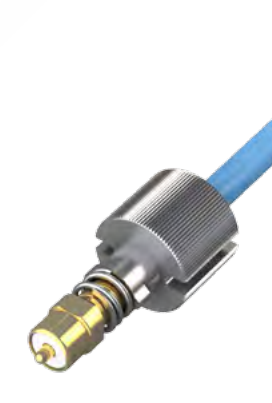
RF25S 25 AWG 50 Ω Single Microwave Cable Adaptor Additional End Options: SMA, SMP