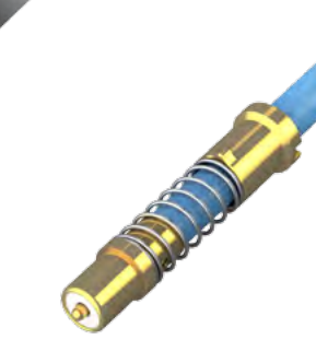
BE23S 23 AWG 50 Ω Phase Matched Microwave Cable Adaptor Pairs Additional End Options: 2.92 Jack/Plug