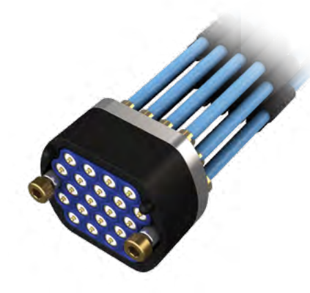
BARA 25 AWG Cable Assembly 22 Positions End 2 Options: SMA, SMP