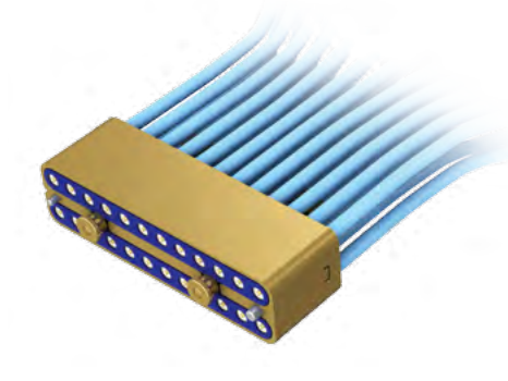
23 AWG Double Row Cable Assembly 24 Positions End 2 Options: 2.92 Jack/Plug