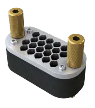
BQR Quad Row Test Point Array 20 Positions